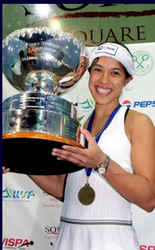
2005.2006.2008.2009.2010.2011.2012.2014* NICOL DAVID Malaysia