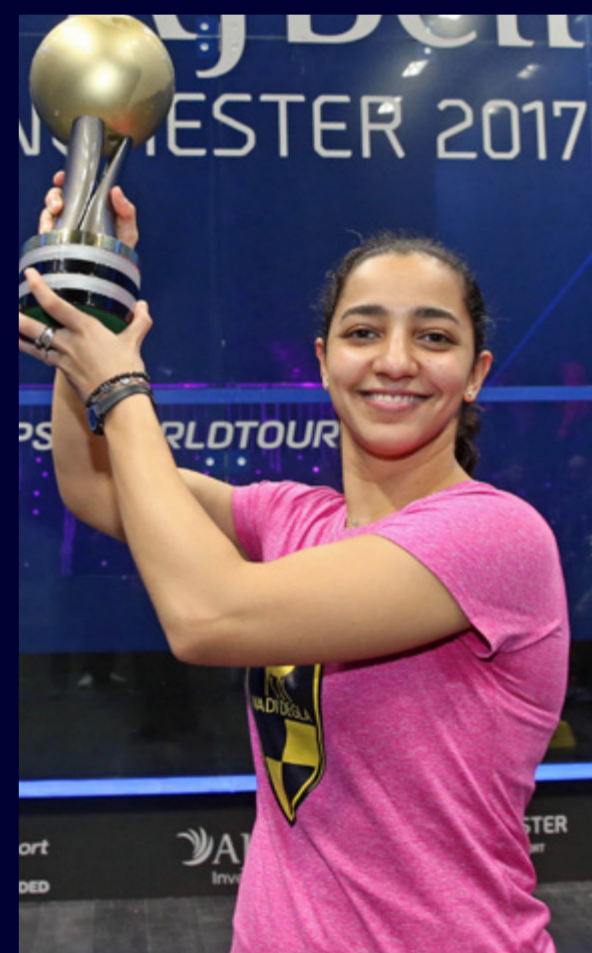
2017* RANEEM EL WELILY Egypt

www.squashlibrary.info info@squashlibrary.info