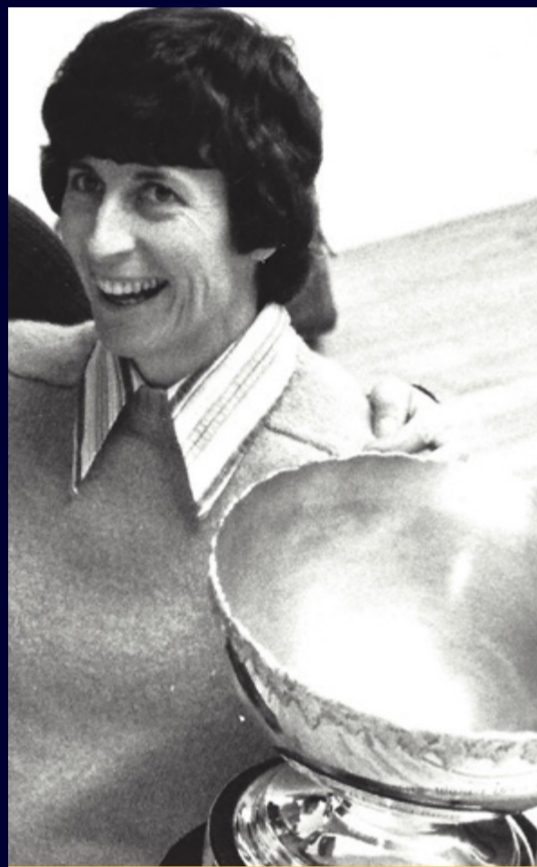
1976.1979 HEATHER MCKAY Australia