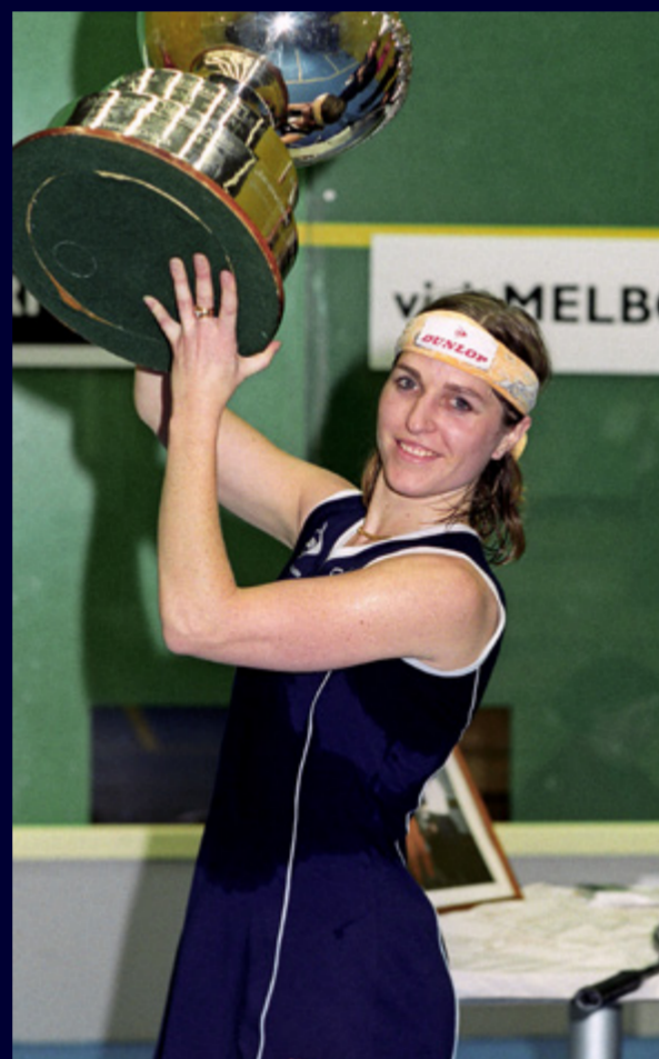
1996.1997.1998.2001.2002 SARAH FITZ-GERALD Australia