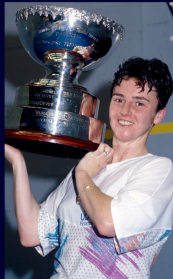
1985.1987.1990.1992 SUSAN DEVOY New Zealand