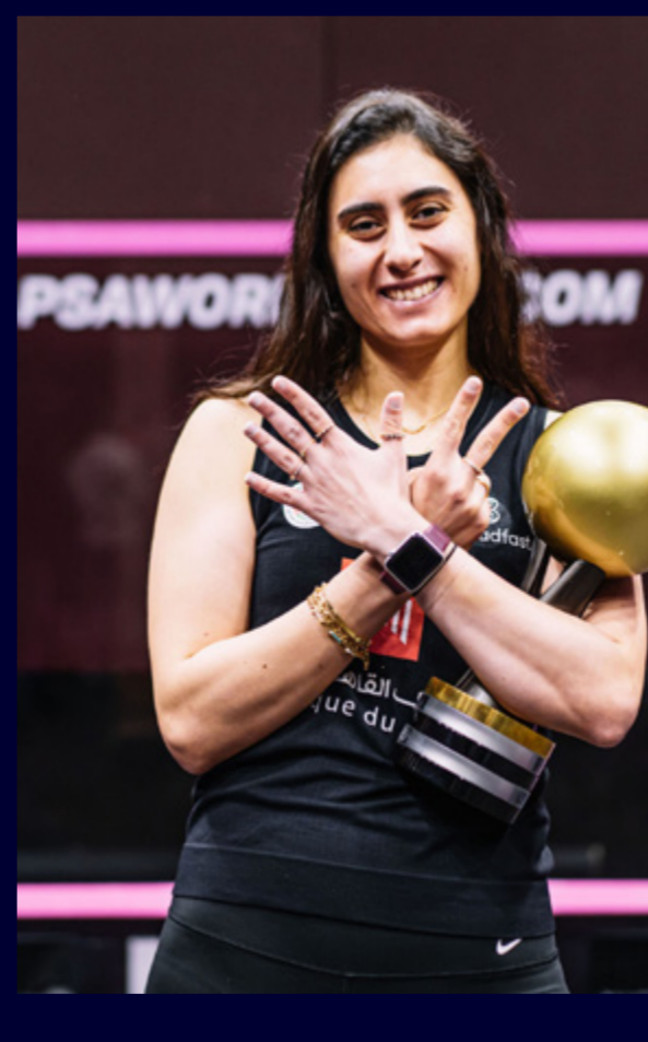
2016, 2017*, 2019*, 2019*, 2021, 2022, 2023 NOUR EL SHERBINI Egypt