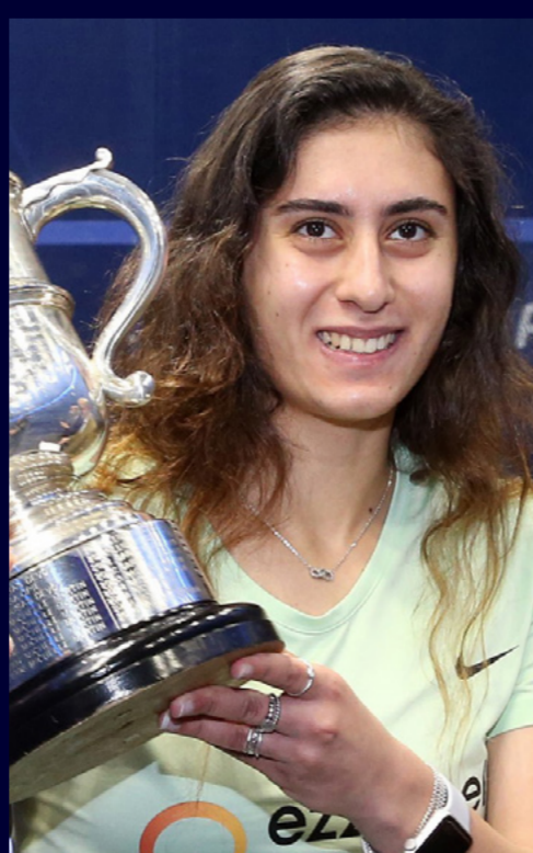
NOUR EL SHERBINI (EGY) [3] 2016,18,21