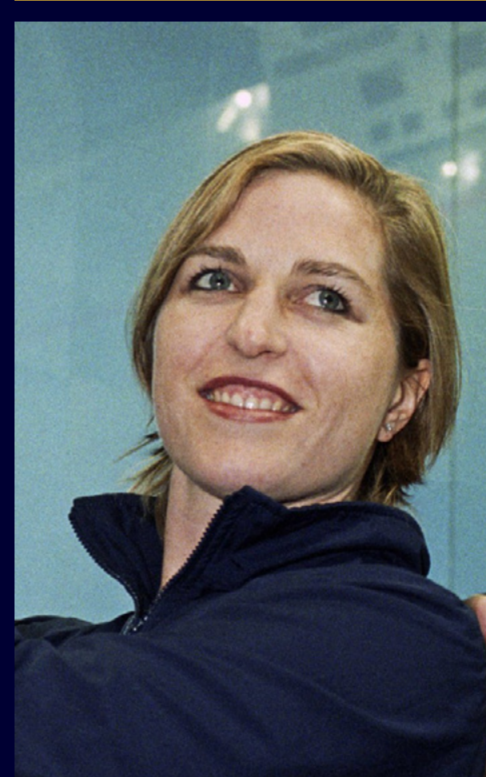
SARAH FITZ-GERALD (AUS) [2] 2001,2