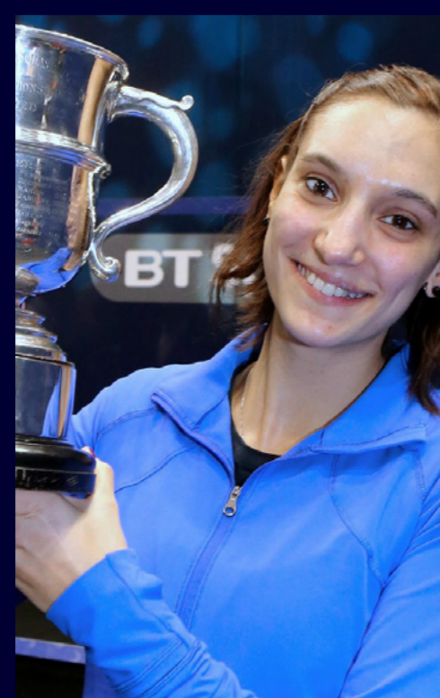
CAMILLE SERME (FRA) [1] 2015