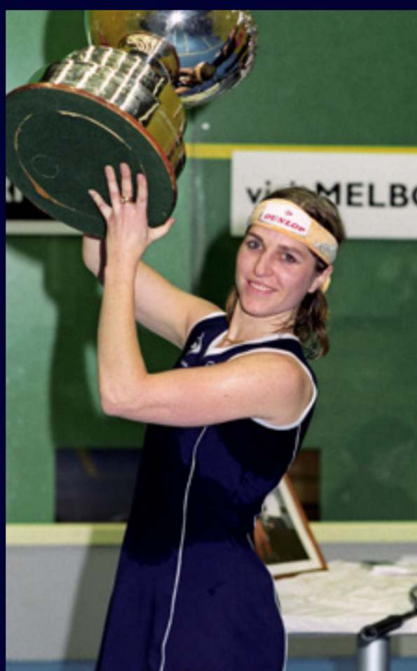
1996.1997.1998.2001.2002 SARAH FITZ-GERALD Australia