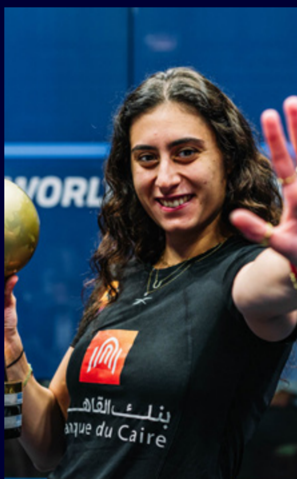
2016.2017.2018/9.2019/20, 2021 NOUR EL SHERBINI Egypt