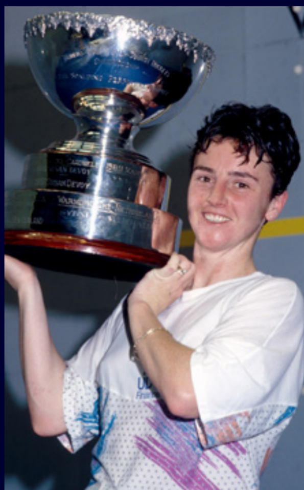
1985.1987.1990.1992 SUSAN DEVOY New Zealand