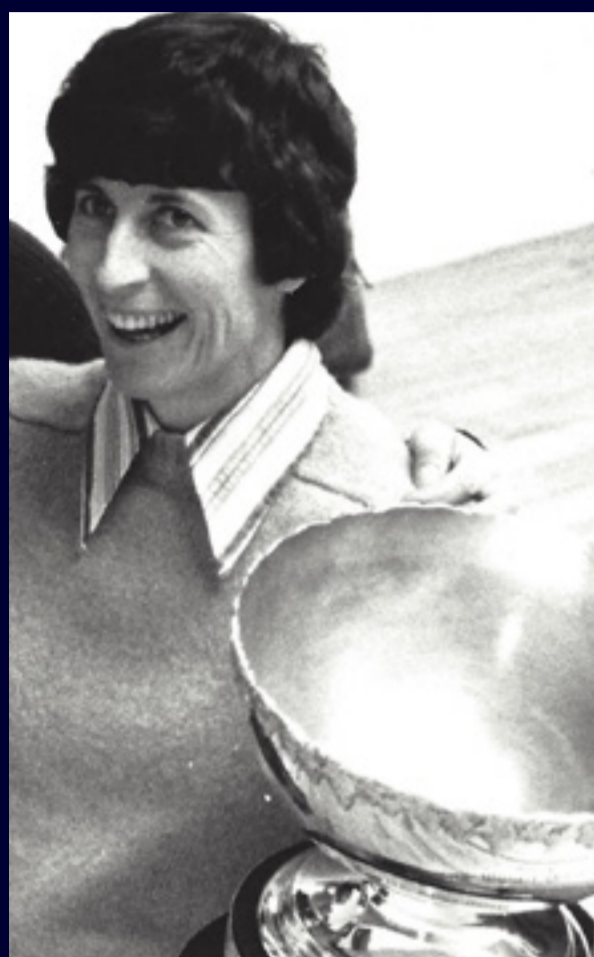
1976.1979 HEATHER MCKAY Australia