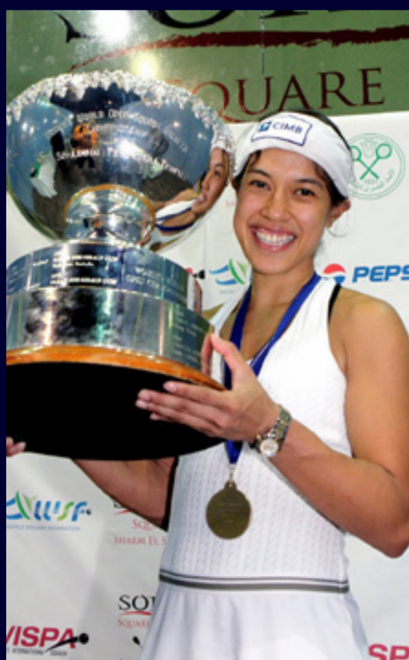
2005.2006.2008.2009.2010.2011.2012.2014 NICOL DAVID Malaysia