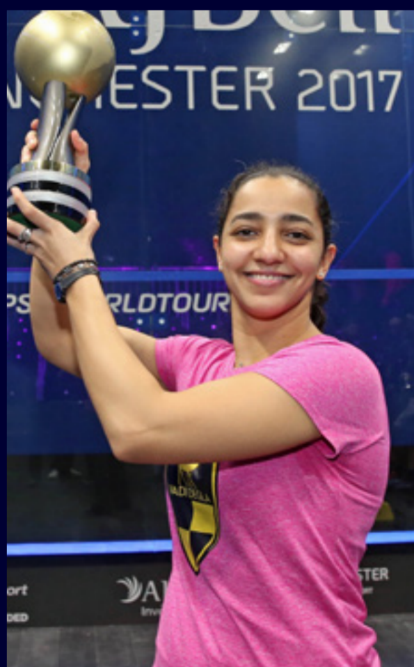
2017 RANEEM EL WELILY Egypt

www.squashlibrary.info info@squashlibrary.info